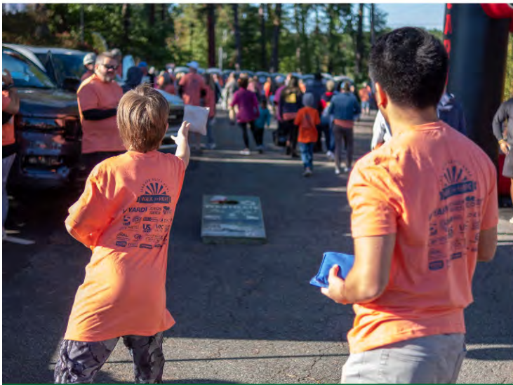
Put your brand on the move with logo placement on 3,500+ participant shirts