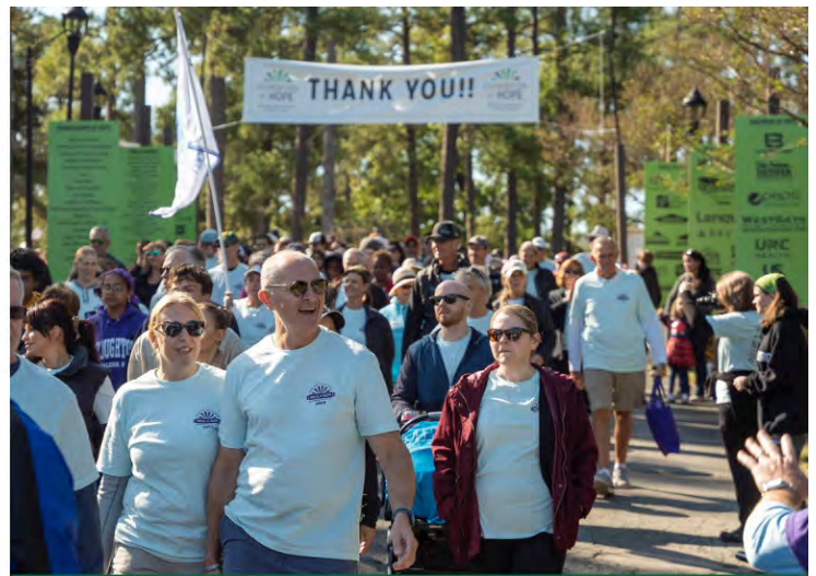
Every walker sees your brand as they funnel through the Angus Barn entrance