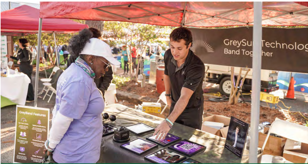
Connect face-to-face with thousands of participants through a dedicated vendor space at our post-walk festival