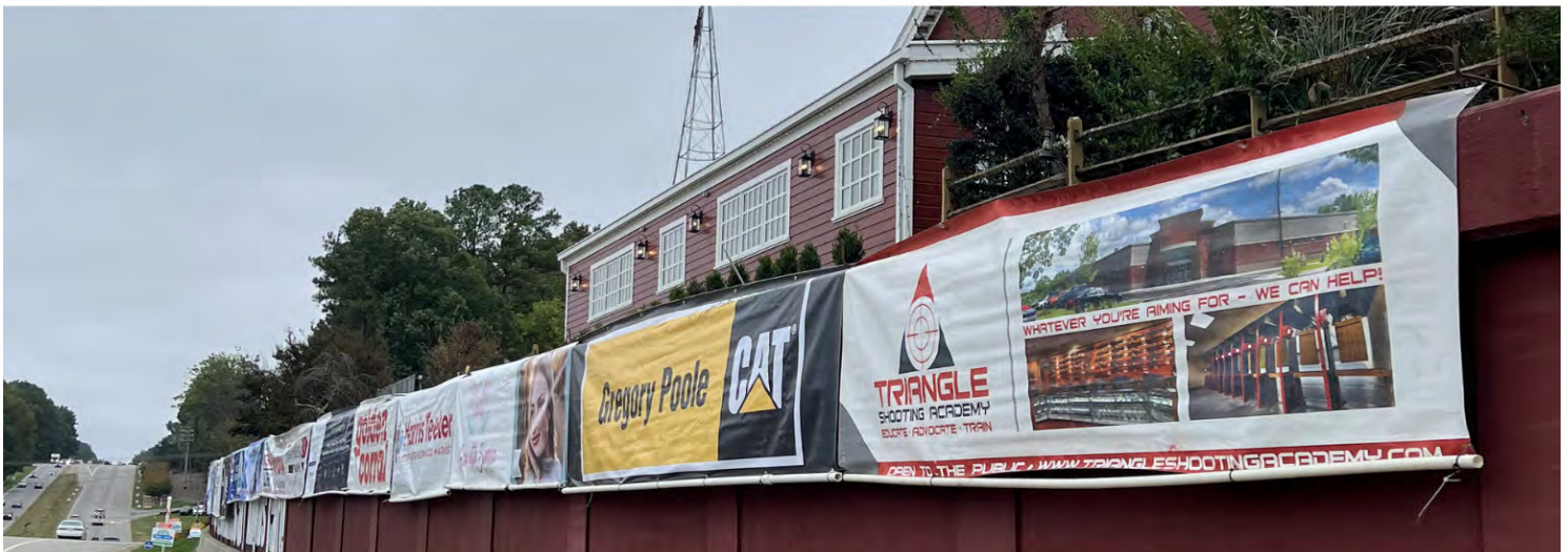
Major brand exposure on Glenwood Ave/Hwy 70, reaching thousands of commuters daily through prominent exterior signage