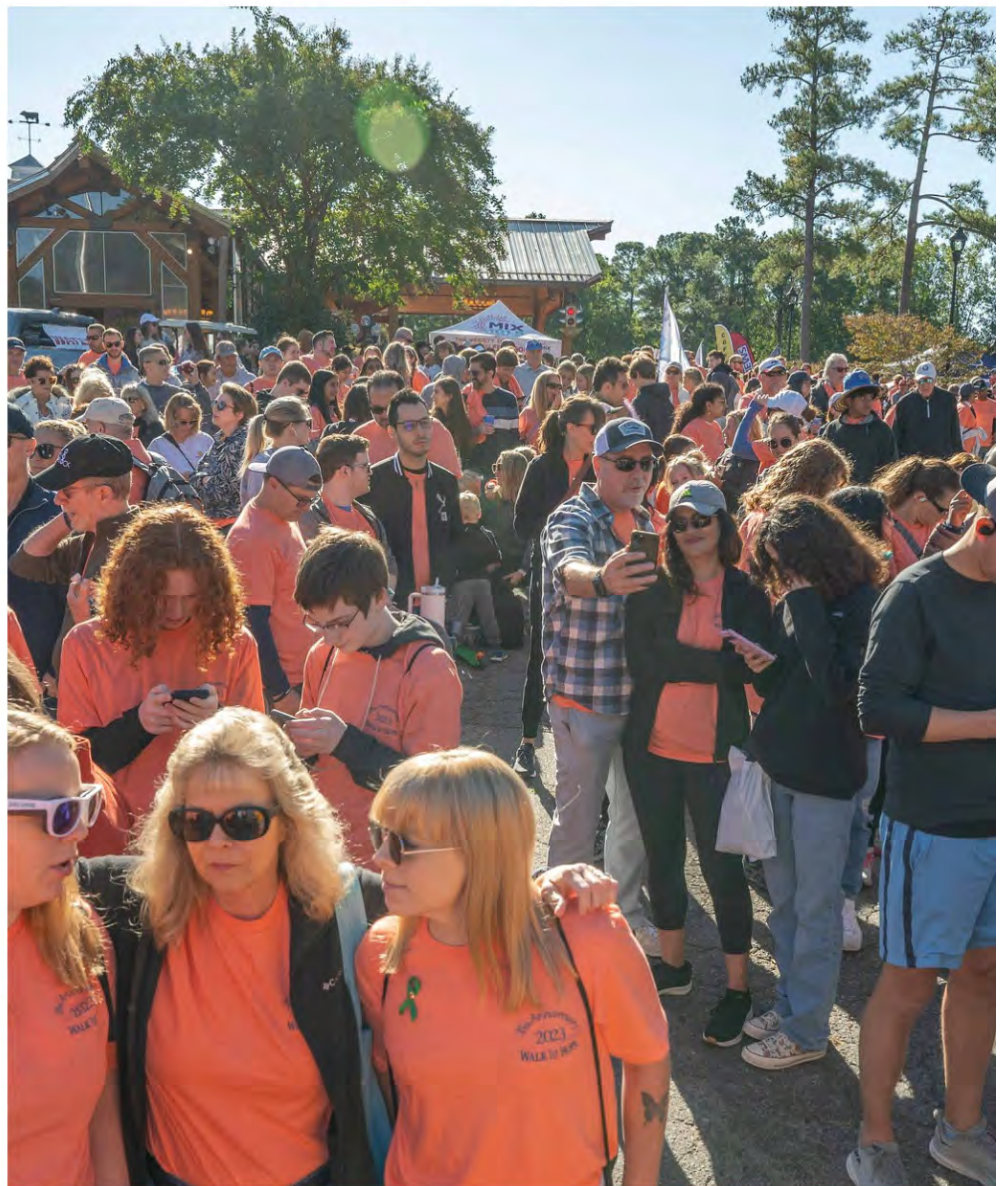
Gain direct visibility through high-energy community engagement