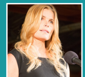
Mariel Hemingway 2013