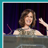
Elizabeth Vargas 2019