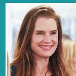
Brooke Shields 2018