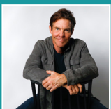
Dennis Quaid 2024