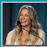
LeAnn Rimes 2022