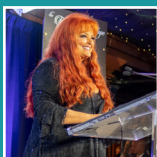
Wynonna Judd 2023