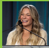
LeAnn Rimes 2022