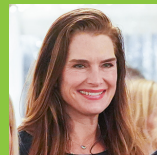
Brooke Shields 2018