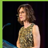
Elizabeth Vargas 2019