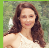
Ashley Judd 2016