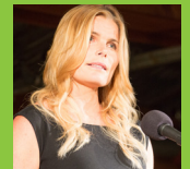
Mariel Hemingway 2013