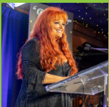
Wynonna Judd 2023