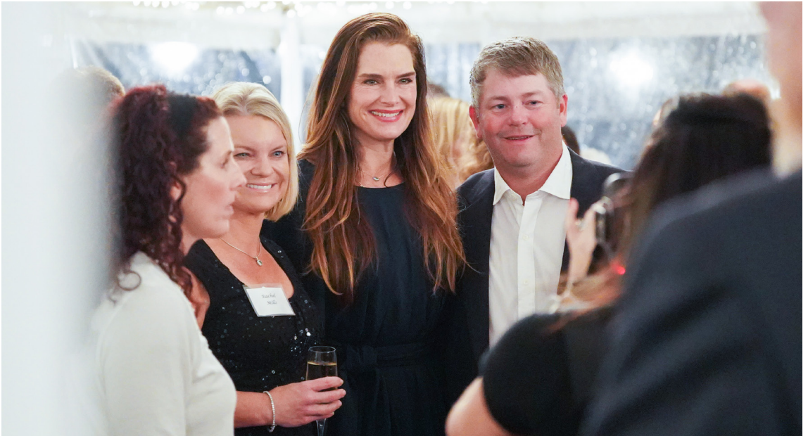
Sponsors with 2018 Speaker Brooke Shields